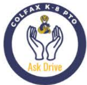
Annual Ask Drive