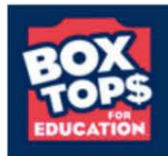
Box Tops for Education